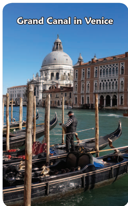
Grand Canal in Venice

Enter Italy via the Europa Brücke (Bridge), a remarkable feat of mountain highway engineering. Descend from the reddish hue of the Dolomite Mountains to the turquoise waters of Lake Garda. In some places, the rocky cliffs rise straight up from the water. Lake Garda's sheltered location gives its coastline a subtropical climate rich in vegetation, including oleander bushes, olive groves and grape vines. Sample a gelato (Italian ice cream) while strolling along the lakeside. From here, it's a short drive to Verona, made famous by Shakespeare's "Romeo & Juliet." Experience an authentic Italian meal during an independent dinner before transferring to your hotel. ( Breakfast )