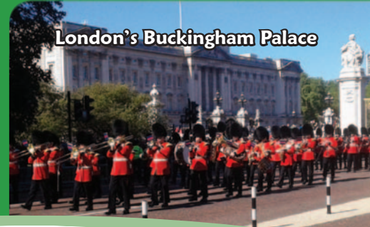
London's Buckingham Palace

Take in all the spectacular sites from our HEART OF EUROPE® Tour, including medieval villages and scenic mountain vistas, while adding Rome, Pisa, Florence, Tuscany, an extra night in Paris, and two nights in London. You will see it all on the Grand Tour!