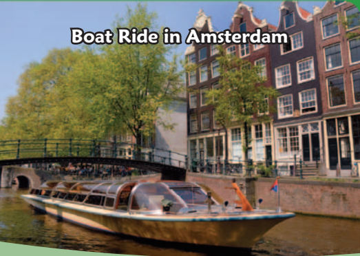
Boat Ride in Amsterdam

22-day tour featuring The Netherlands, Belgium, Germany, Austria, Italy, Switzerland, France and England