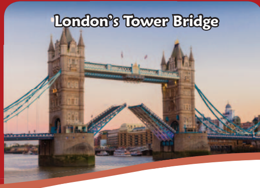
London's Tower Bridge