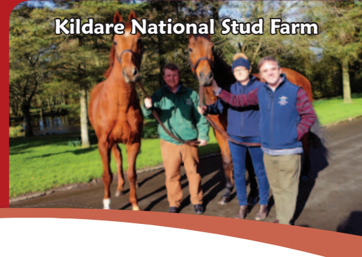
Kildare National Stud Farm

A showcase tour of Britain and Ireland awaits you! Ancient castles, glorious cathedrals, royal venues and majestic countrysides make this an enchanting journey. Two-night stays in five of the overnight cities contribute to an in-depth tour with many highlights.