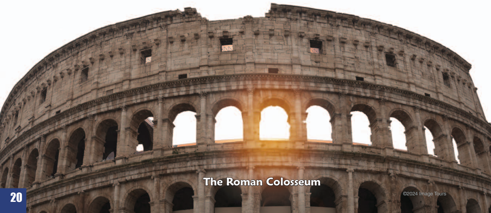
The Roman Colosseum

Image Tours can arrange an extended stay at your last tour hotel in Rome. Consult the Dates & Prices Guide insert for prices.