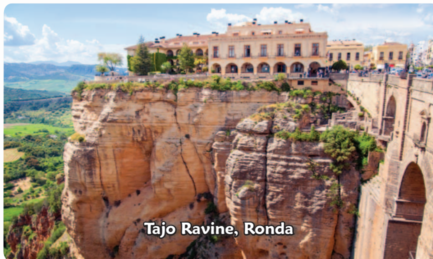
Tajo Ravine, Ronda

DAY 13 - SPAIN . . Granada – Costa del Sol. This day focuses on the city of Granada, elegantly enrobed by the surrounding Sierra Nevada mountains and crowned by the astounding Alhambra. In Arabic, Alhambra means "Red Castle." Granada's Alhambra was