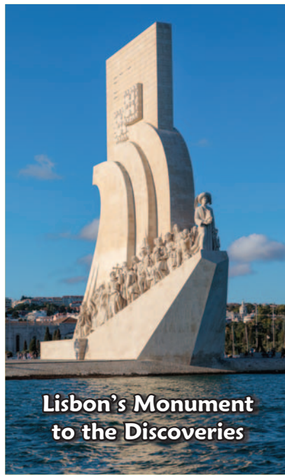
Lisbon's Monument to the Discoveries

To initiate your sightseeing, a local guide will provide an orientation of Madrid and an explanation of the masterpieces inside the Prado Art Museum. Three popular choices for your afternoon are the Old Town of Madrid (referred to as Puerta del Sol), El Retiro Park (where you can rent a row boat on its Great Lake), or the Reina Sofia Museum (home to Picasso's Guernica). Tonight's independent dinner allows you to choose